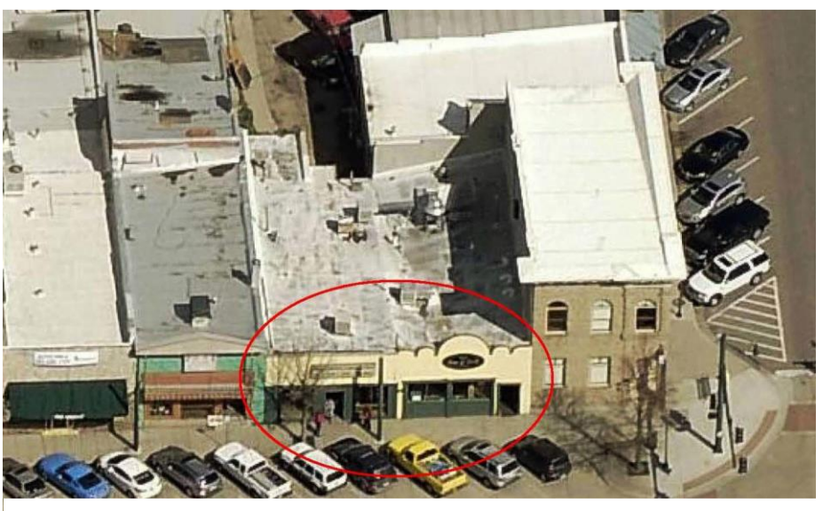
Pictometry View of Existing Wilcox Street Façade

buildings were later combined into one business in 1997, but the two entrances from Wilcox Street remain. The property was later platted into one lot with the singular address of 302 N. Wilcox Street, as it is known today. Castle Rock Municipal Code 15.64.060, Town of Castle Rock Historic Landmarks, still lists historic designations for