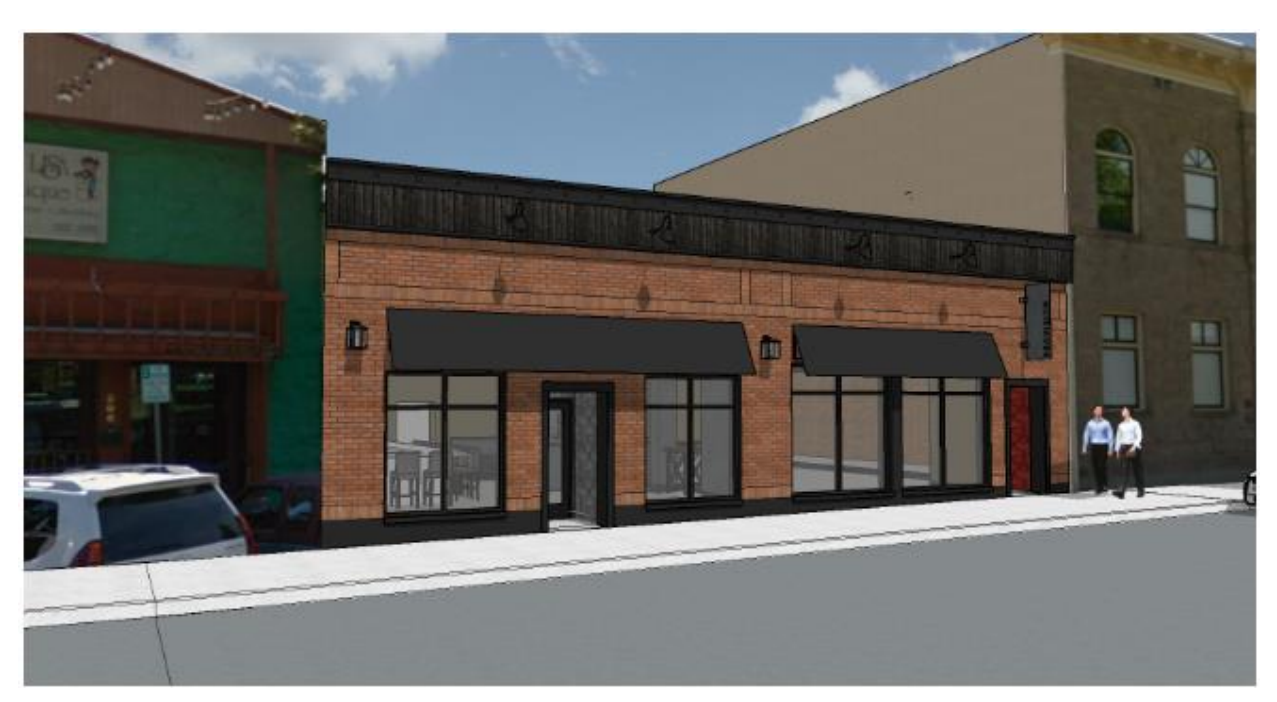
Proposed Façade Improvements (not a part of this application)

The applicant's narrative (Attachment E) outlines the request to remove the Landmarking status. The façade improvements proposed in the application would potentially not be approved as a landmark alteration certificate due to complete removal of the historic façade.