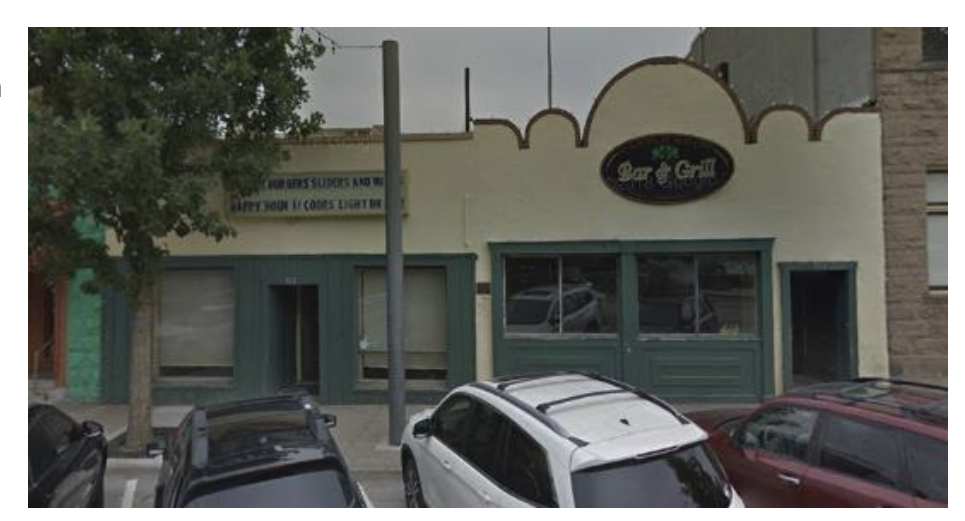
Street View of Existing Wilcox Street Façade

red-capped brick arched parapet on the southern portion of the building is original and dates back to 1939. In 1973, a car hit the southerly 302 N. Wilcox and created heavy damage, requiring the replacement of a portion of the lower facade and windows below the parapet. The