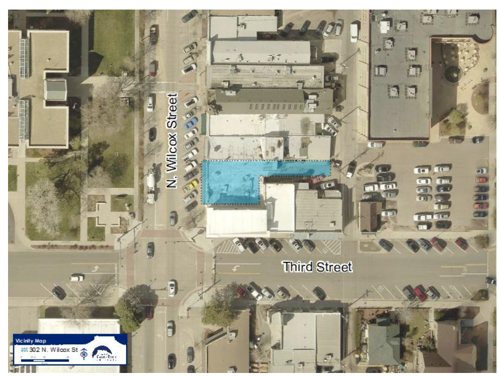
302-304 N. Wilcox Street (NE from the intersection of Third & N. Wilcox Streets)

Milestone Properties, LLC, the current property owner of 302 N. Wilcox Street, has submitted a request to remove the Landmarking status on the property to allow for the renovation of the exterior façade of this locally landmarked building. The proposed exterior renovations required consideration by the Historic Preservation Board for removal of the Landmarking status on this property. On May 1st, the Historic