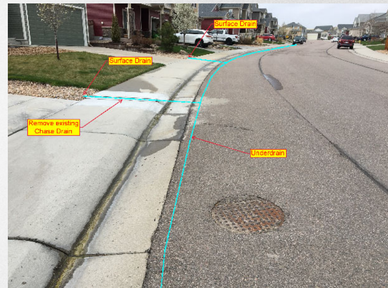
Underdrain below pavement in front of gutter, surface drains at each property line