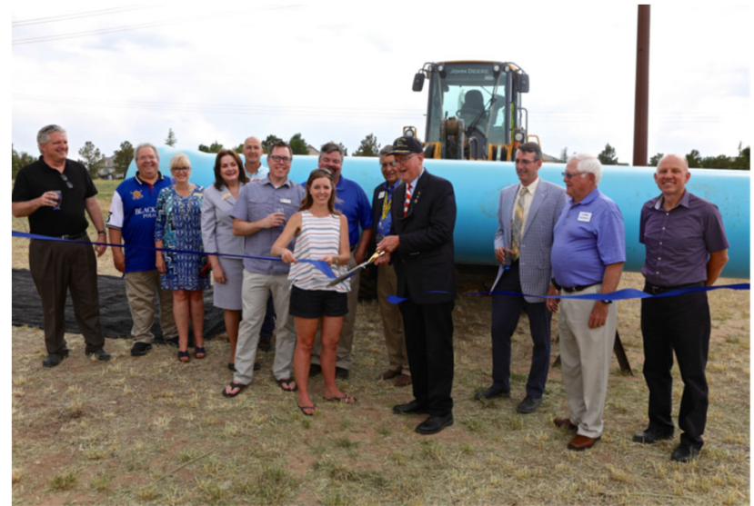
WISE Ribbon-Cutting Event on June 8, 2018