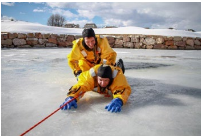
Photo of ice rescue training