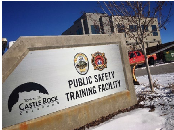
The newly occupied PSTC South Building