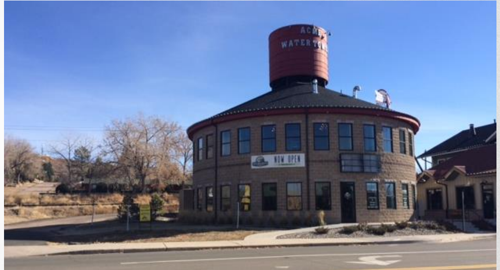
View from Perry Street