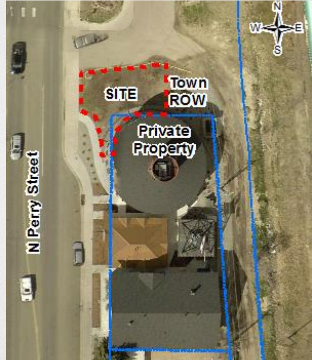
Project included on Town Right-of-Way

Project encroaches Town Right-of-Way Permit required