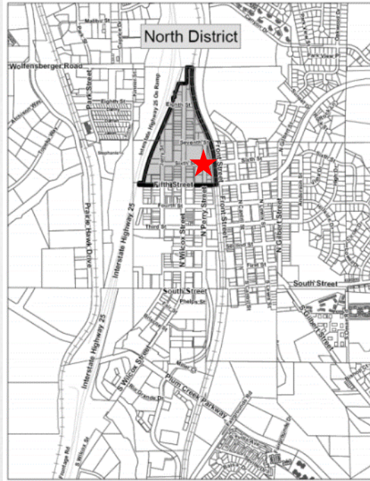
Iron Mule Brewery

Downtown Overlay District North District