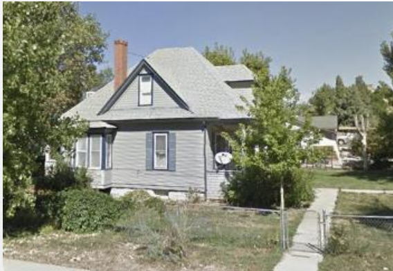
EXISTING SIDE VIEW