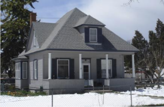
EXISTING FRONT VIEW