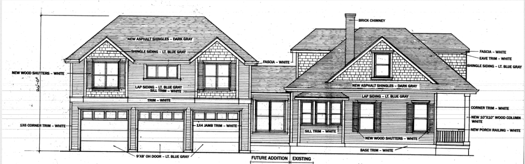
PROPOSED SIDE VIEW