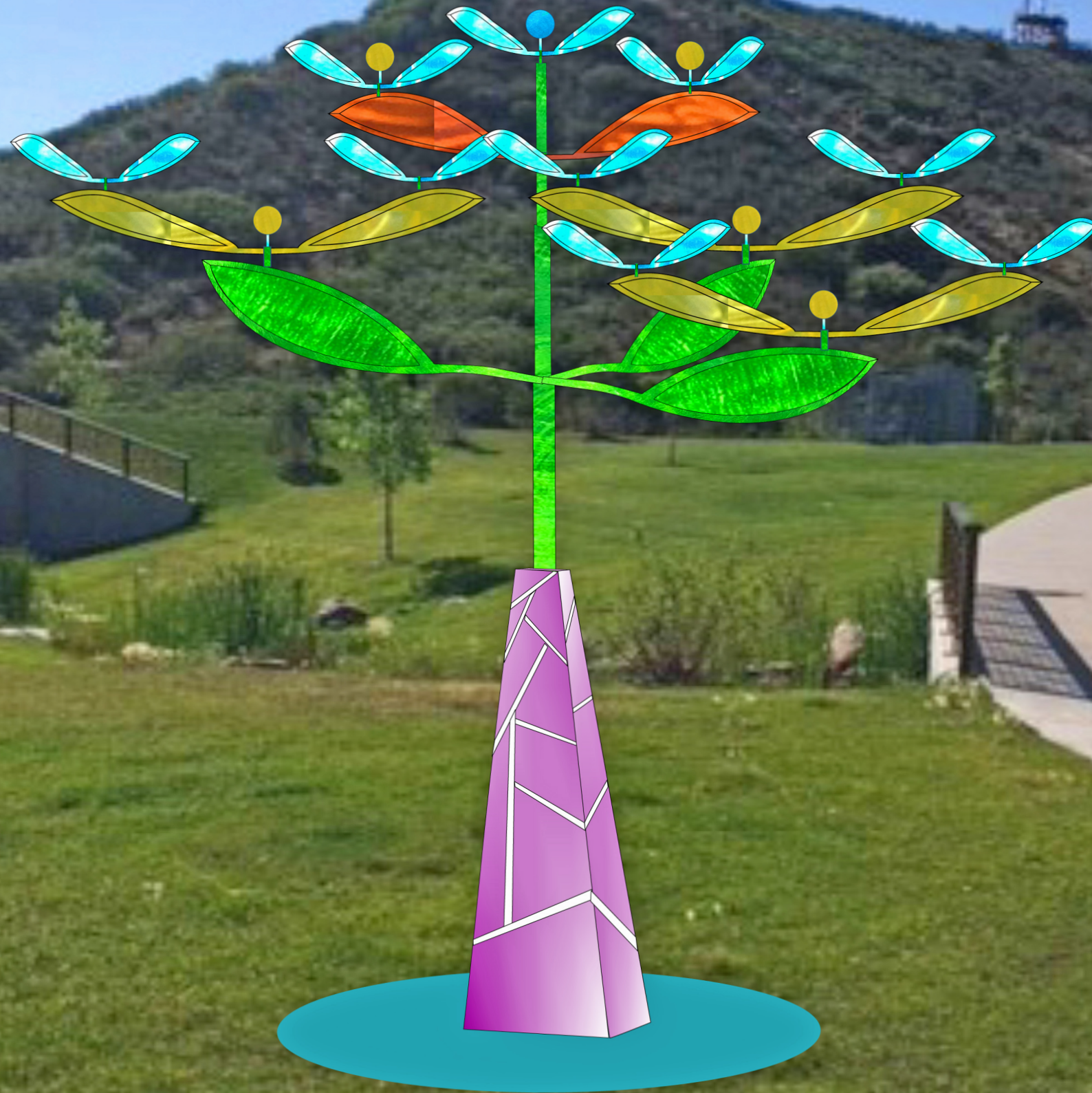
Tree of Wings - A