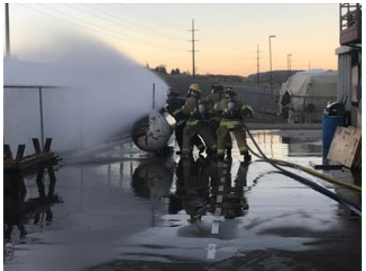
Two Hose Teams direct LP Gas away from sources of ignition while the team leader shuts off the valve