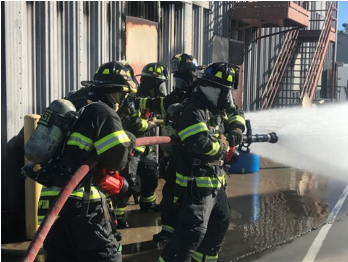
Members prepare to advance on the new 500 gallon LP Tank prop