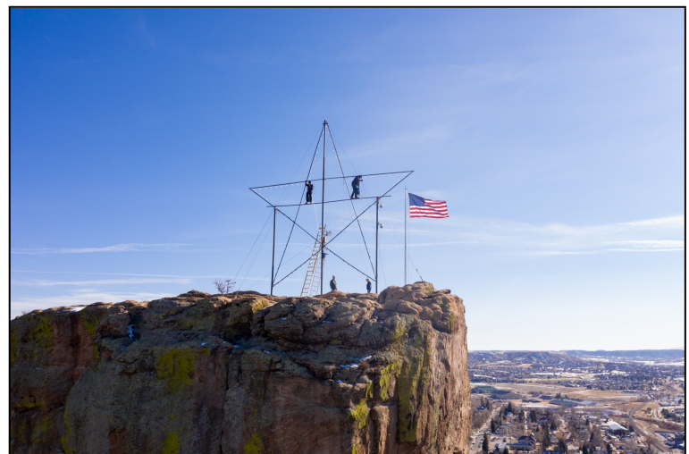
Prepping the star