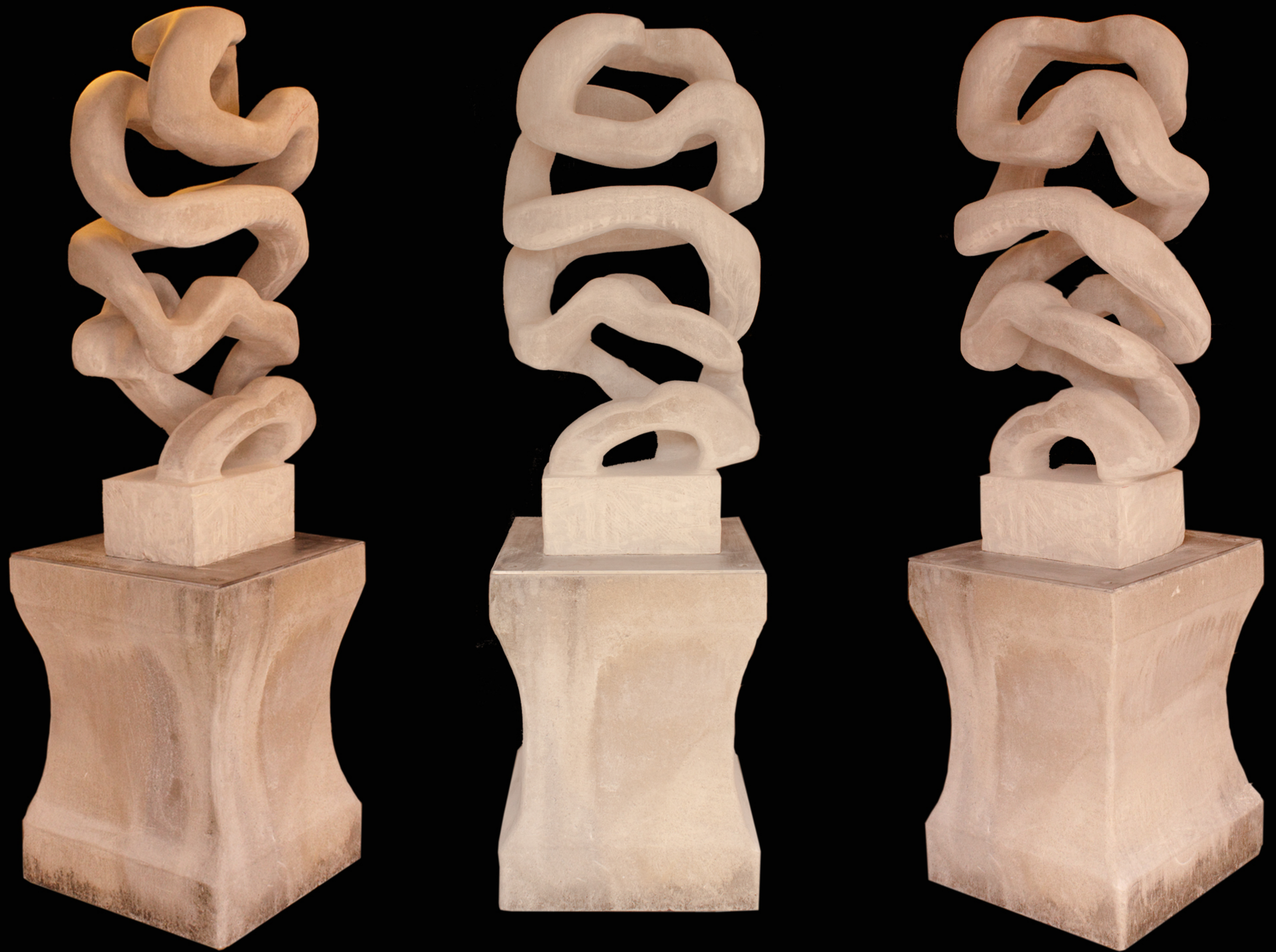
Three Views of Voyage Sculpture