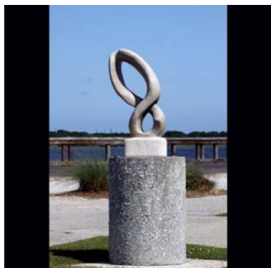
Image 04 "Ambit" Sculpture. installed in North Charleston, South Carolina

I look at Aria and see a singer, well-trained and confident, opening her mouth to start singing a solo aria in Opera. Aria is about being a confident person in a competitive environment. The reason for thinking Aria belongs in an opera genre is the stippling of the upper third of the sculpture and also the sweeping lines which connote a sweeping costume.