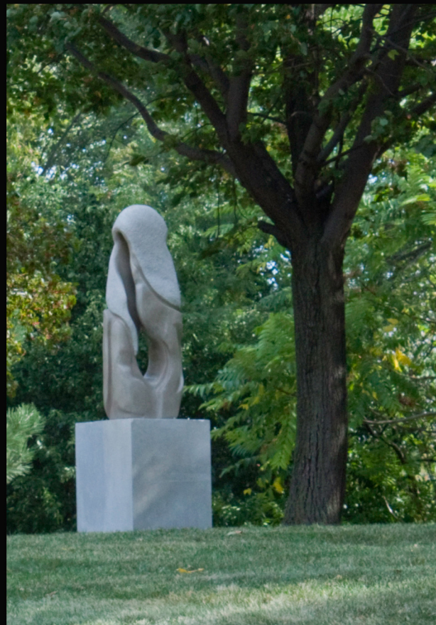
Aria at Northshore Sculpture Park Skokie, IL