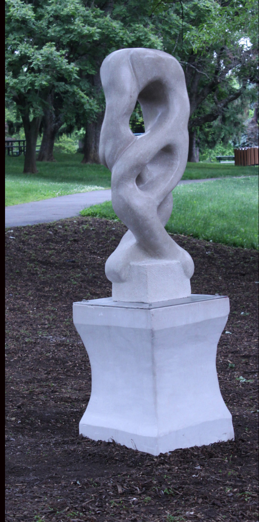
Coordinate Harmony in Rockville, MD