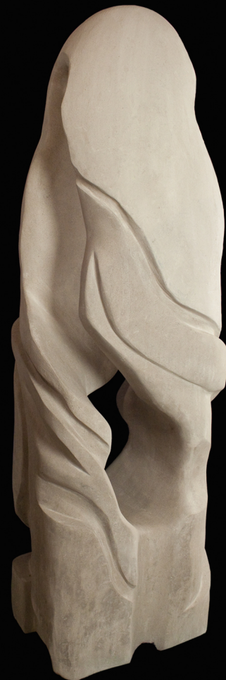
Determination Sculpture (about 7/8 done)