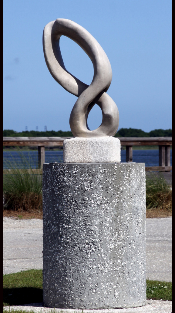
Ambit in North Charleston, SC