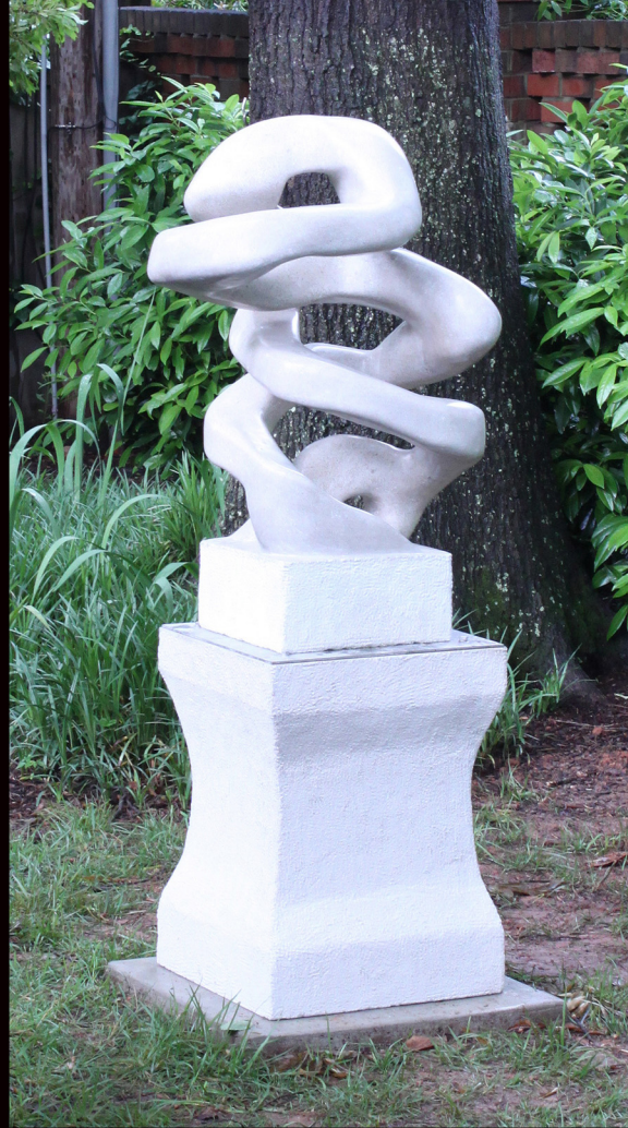
Journey in Charlotte, NC