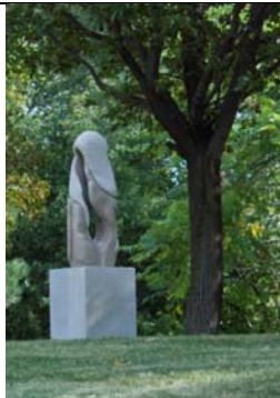
Image 03 Aria Sculpture at Northshore Sculpture Park in Skokie, IL. Aria

Journey is how life is not a straight line but rather an involved process that is easy to understand when you stand outside of it but hard to fathom when you are living the situation.