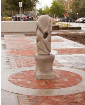
Image 05 Eihei permanently installed in Mount Dora in January 2012

"Eihei" Translation: Guardian or Sentinel