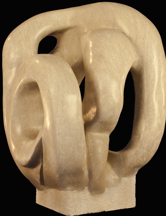
Front & Side Views of Sound of Joy Sculpture