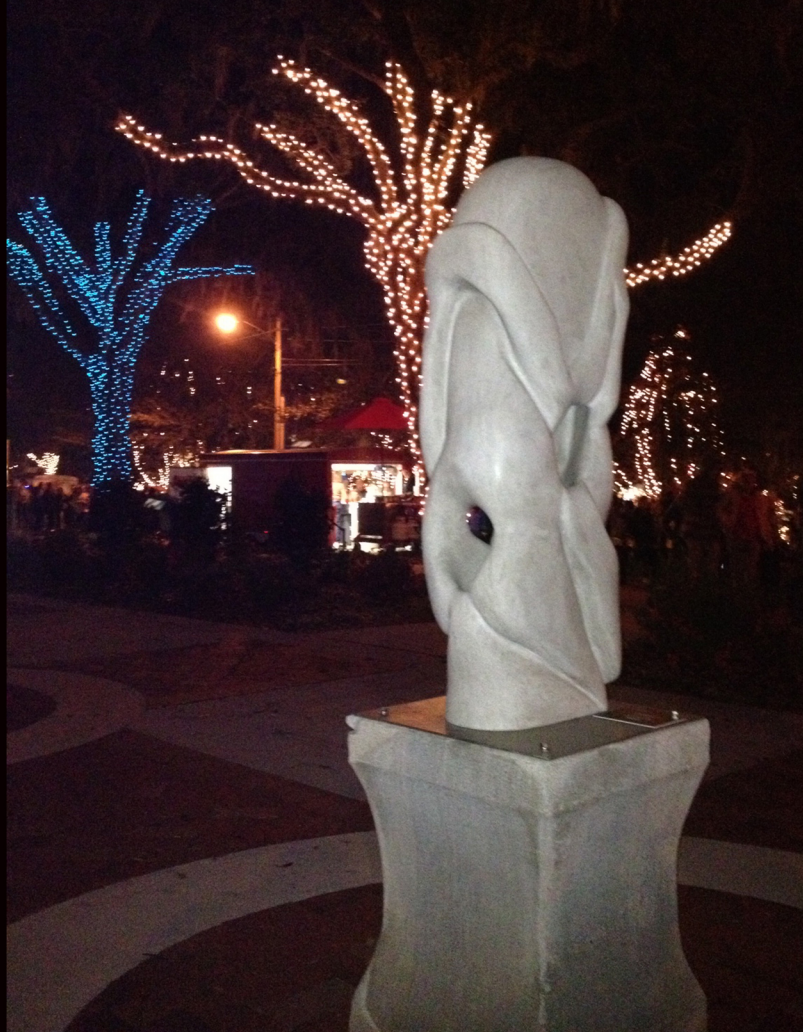
Eihei in Mount Dora, FL