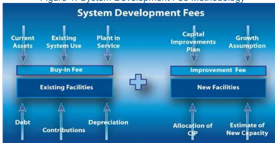
Figure 1: System Development Fee Methodology

When properly designed, an SDF should be a one-time charge to new connections to the system that recovers the utility's investment to provide capacity to new growth, either as a capital improvement or an infrastructure expansion. At any given moment, a utility will have a certain amount of capacity in its system that is available to serve new customers while at the same time, it will have plans for new capital improvements and/or facilities expansions to serve anticipated growth in demand. To the extent that the system has available capacity, it can be said that the utility has already made an investment in new capital improvements and/or facilities expansions whose cost remains unrecovered.