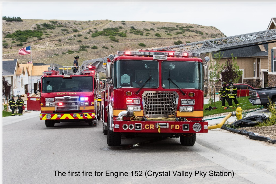
The first fire for Engine 152 (Crystal Valley Pky Station)