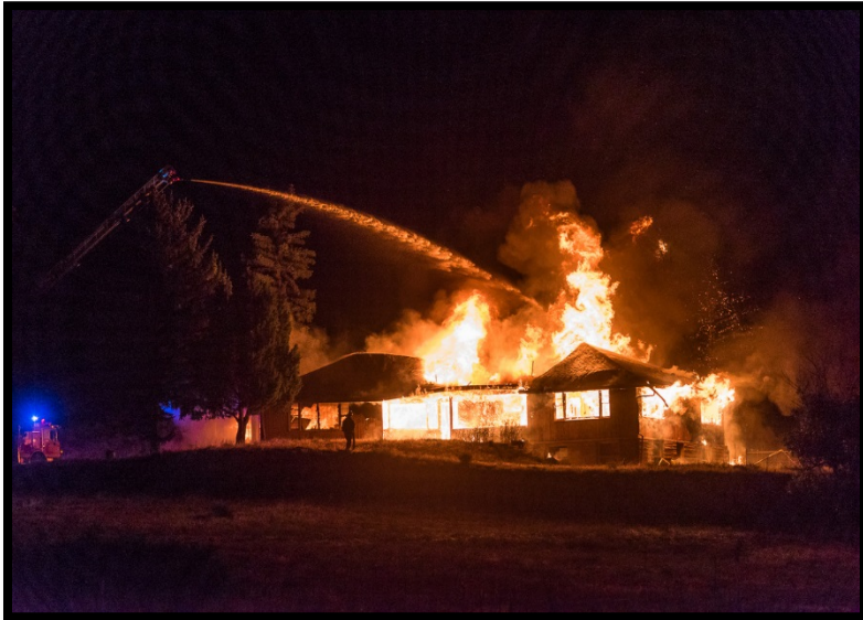
Abandoned house fire on Wolfensberger Rd. on 7/27/18