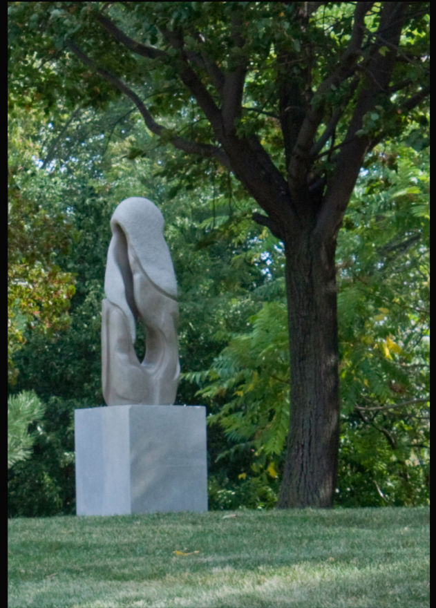
Aria at Northshore Sculpture Park Skokie, IL