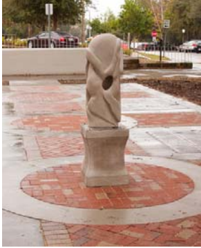
Image 05 Eihei permanently installed in Mount Dora in January 2012

"Eihei" Translation: Guardian or Sentinel