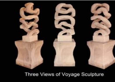
Three Views of Voyage Sculpture

The design flows (in front view) from the lower right circles around to the left & goes inside the first circle & connects to the second (middle) circle. The second circle rears up comes down & connects to the third (largest circle – in the back) circle. The large circle arches over the second circle & comes to rest on the left side of the front view