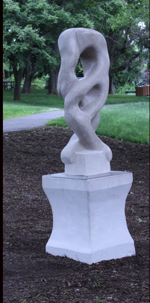
Coordinate Harmony in Rockville, MD