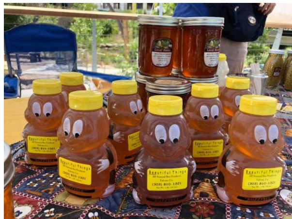
A variety of local produce, breads, honey, herbs, tamales and artisans are featured at the Festival Park weekly farmers' market