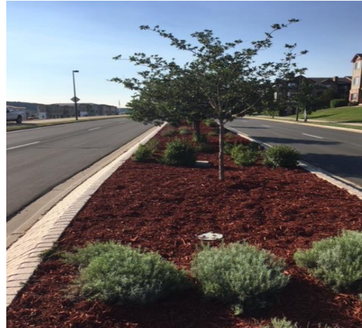
Plum Creek Parkway