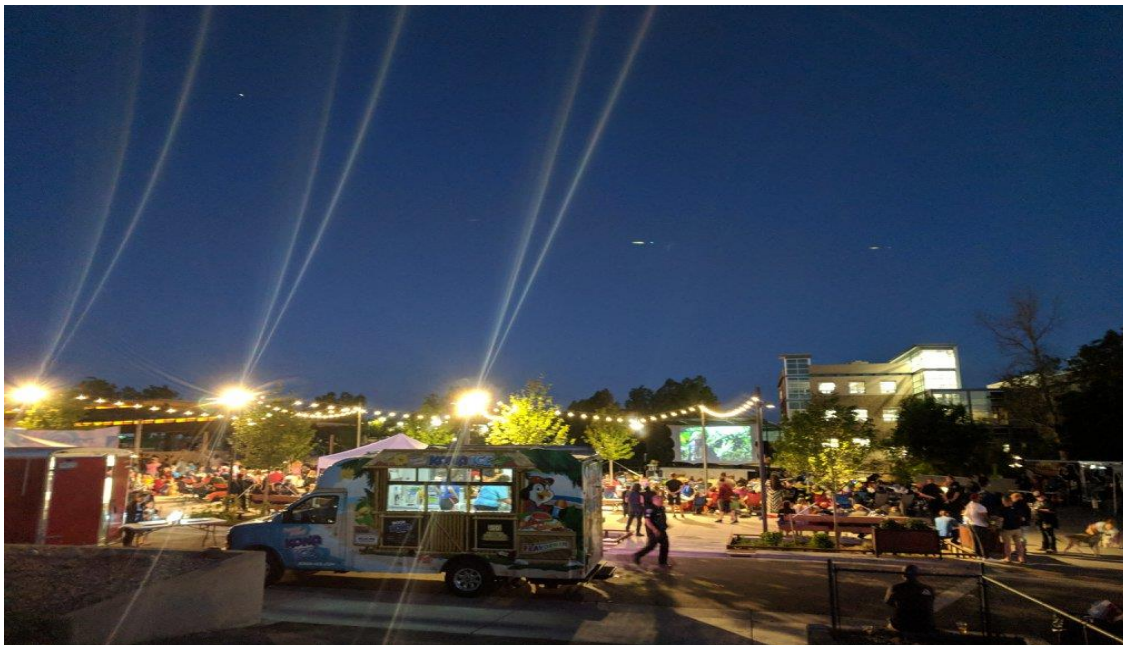
The Downtown Merchants Association hosted the first movie night at the reimagined Festival Park.

Festival Park Grand Opening Weekend kicked off on June 1 with Casino Night. Attendees were treated to a free night of casino games, live music by Vintage Vocal Trio, food trucks and cocktails. The Grand Opening weekend was designed to showcase Festival Park's multi-faceted new design elements. The park is unique in that it can be host to concerts, weddings, movie nights, farmers' markets, races and more!