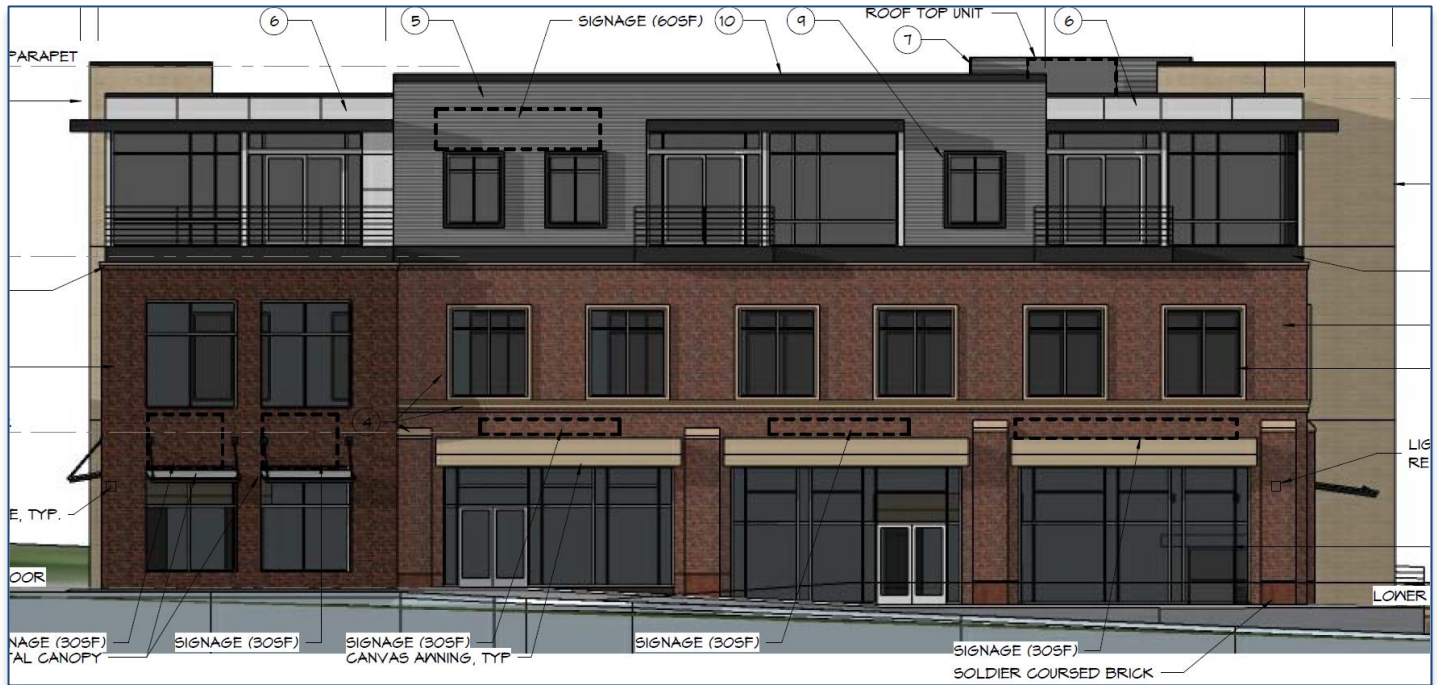
Front (East) Building Elevation

A total of 48 parking stalls are required to serve the proposed uses. The Meadows Town Center zoning allows parking as the primary use on a lot, and also allows the required parking to be accounted for with on-street spaces. Twenty-nine on-site parking stalls will be constructed on Lot 1A-1 (highlighted in brown above), with an additional 19 spaces provided on the street; 16 parallel spaces along Future Street and 3 diagonal spaces on Ambrosia Street. Two of the spaces on Ambrosia Street are designated as handicapped accessible, served by an accessible aisle. None of the parking stalls have been allocated to other buildings or uses.