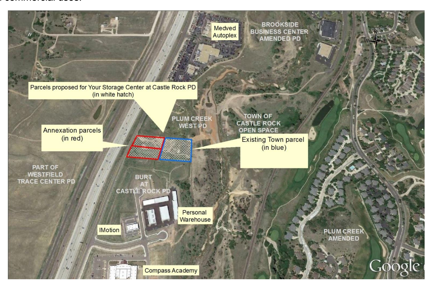
Figure 2: Your Storage Center at Castle Rock PD property and surrounding zoning & uses

To the north and east of the proposed annexation property resides vacant land within the Plum Creek West Planned Development which is zoned for office and retail uses; to the south are private drainage ponds. Further to the north is the Brookside Business Center Amended Planned Development which is zoned for a mix of light industrial, commercial and office uses and contains the Medved car dealership; further to the south is IMotion, Personal Warehouse and Compass Academy, all within the Burt at Castle Rock Planned Development, which is zoned for a mix of light industrial and commercial uses.