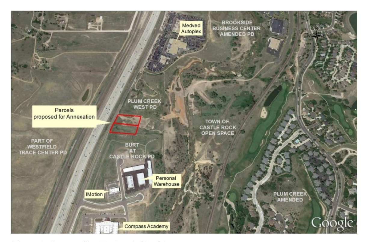
Figure 2: Surrounding Zoning & Use Map

substantial compliance with Section 30 of Article II of the Colorado Constitution and also found it to meet the required statutory findings concerning its eligibility for annexation. Please note that Planning Commission hearings were not required for the Annexation Petition review.