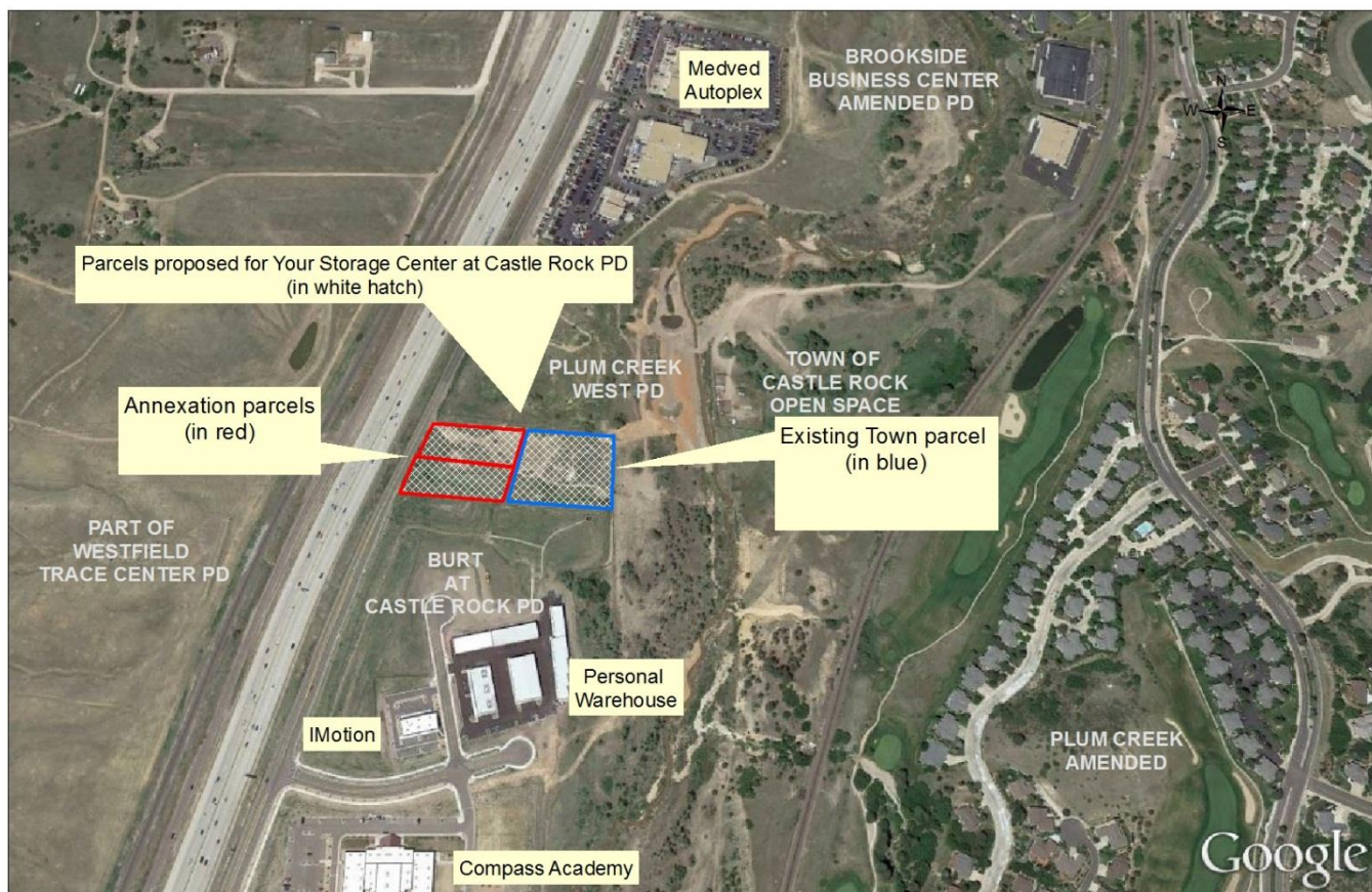
Figure 2: Your Storage Center at Castle Rock PD property and surrounding zoning & uses