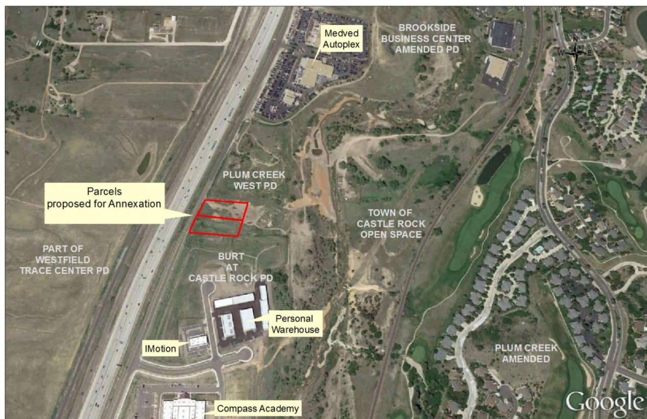
Figure 2: Surrounding Zoning & Use Map

The proposed annexation property lies within an evolving light industrial/commercial area of Town which is visible from the I-25 corridor and surrounded by Town properties to the north, east and south