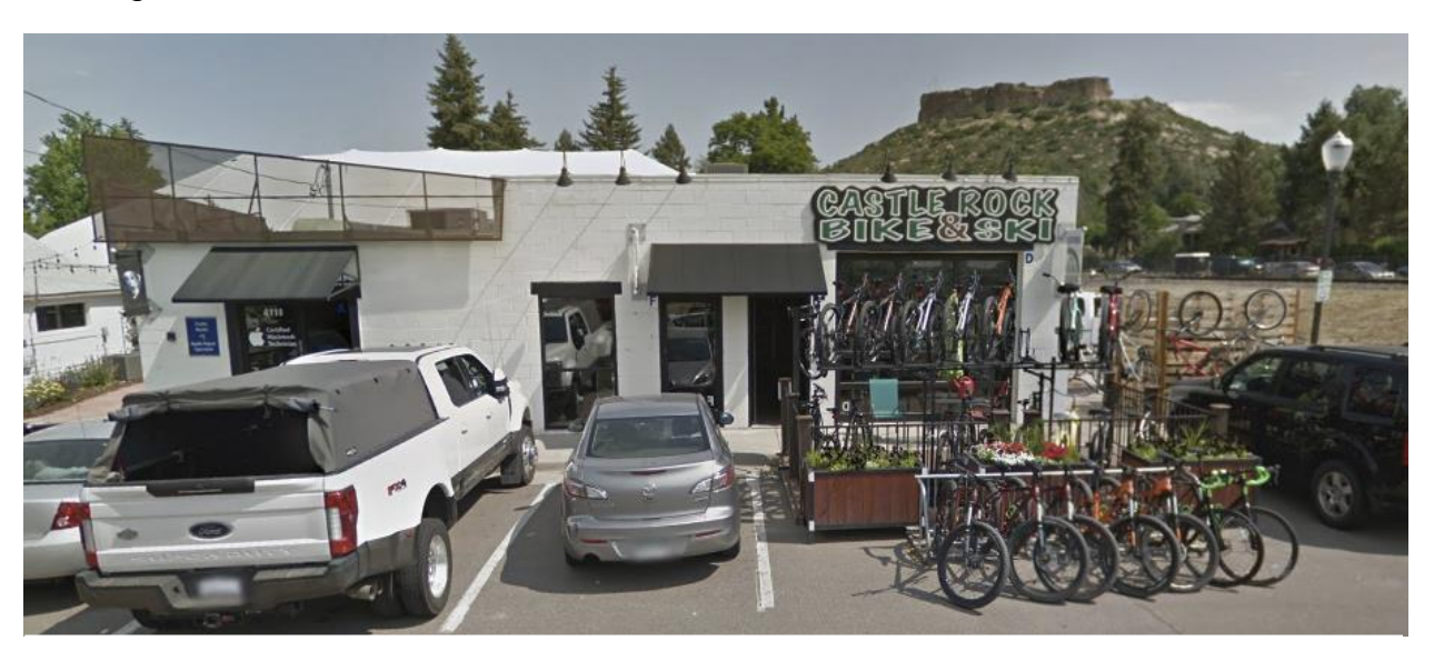
Existing View from 4th Street of South Façade of Building