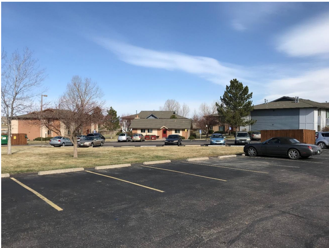
Figure 3: Looking Northwest from the Eastern Parking Lot