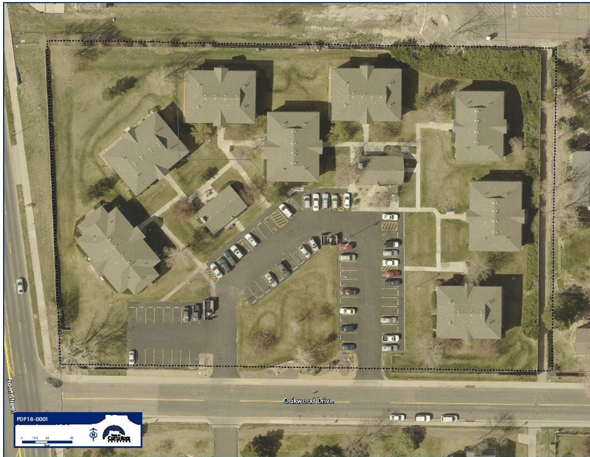
Figure 2: Existing Property Layout