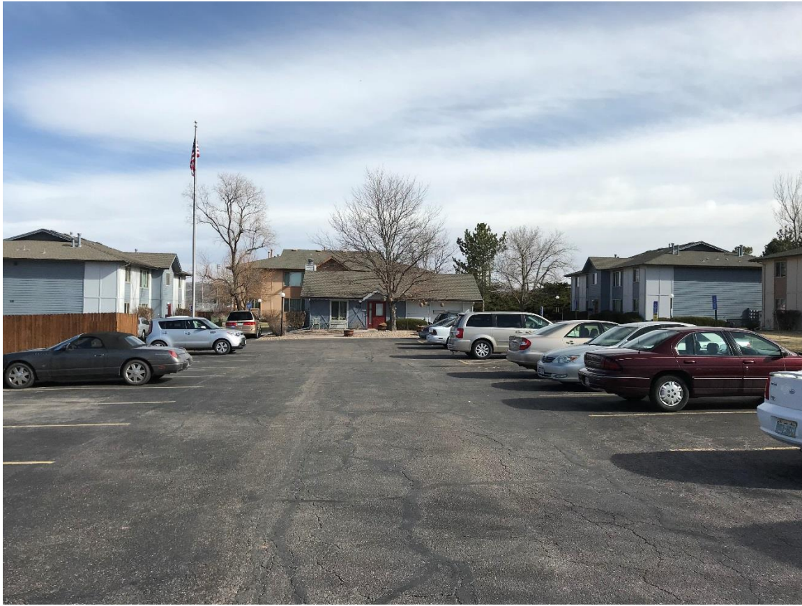
Figure 4: Looking North from the East Parking Lot