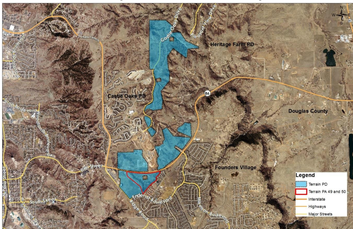
Figure 1: PA 49 and 50 within the Terrain Planned Development (PD).

The proposed development site is within Planning Areas (PA) 49 and 50 of the Terrain, which are also known as Sunstone Village of the Terrain. Sunstone Village PA 49 and 50 are located