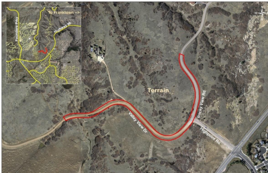
Figure 1: Vicinity Map

The Terrain community is located in northeast Castle Rock where State Highway 86 sweeps up and out of Castle Rock towards Franktown. Valley View Drive currently travels through the community in a loopy east-west direction while Rocky View Road travels through the community in a loopy north-south direction. Both roads join at a T-intersection at Highpoint Road; Highpoint road then leads you out of the community onto Colorado State Highway 86. Both rights-of-ways were originally platted in 1972 as part of the Castle Oaks Filing No. 1 Plat. Each right-of-way is 60-feet wide.