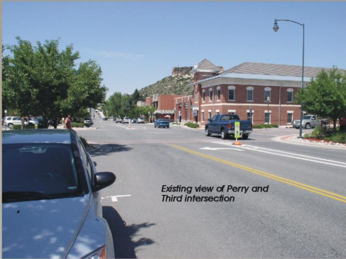
Existing view of Perry and Third intersection