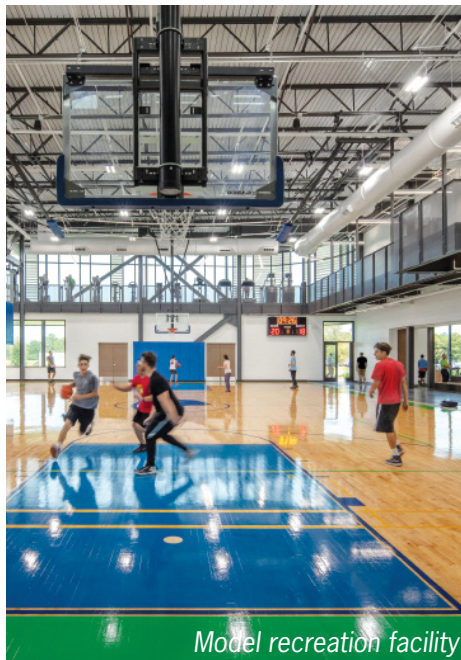
Model recreation facility