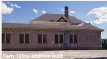
Early 1930s addition built

2022 Douglas County School District designates property as surplus and makes it available for purchase