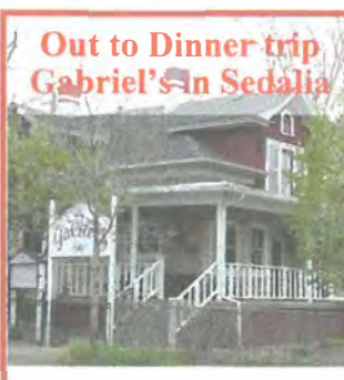
Thurs., 10/20, 4:00 PM $10 Activity Fee Dinner in their Bistro