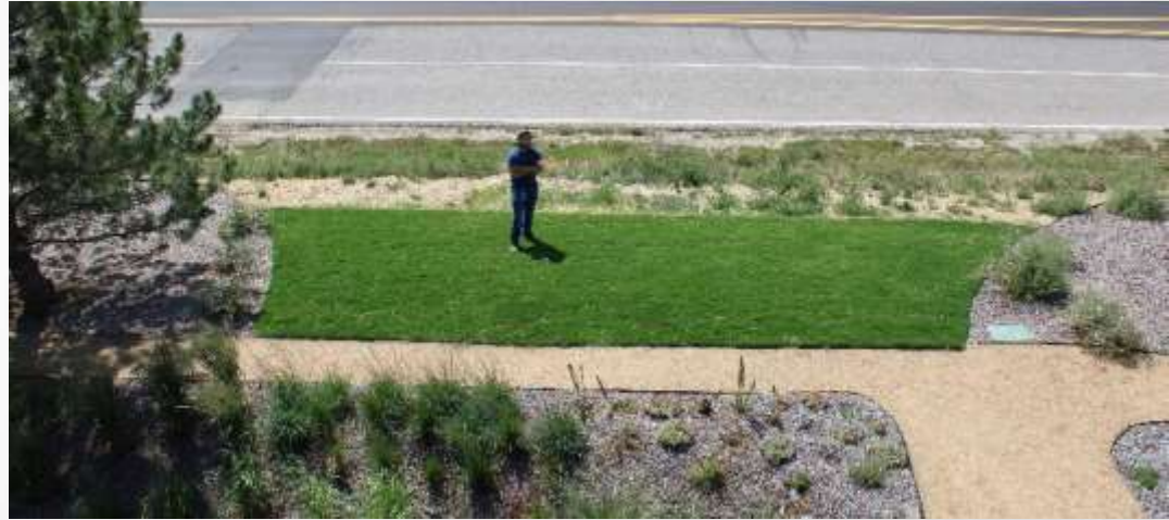
500 square feet of Experimental Tahoma Bermuda (super low water using turf) at Castle Rock Admin Building