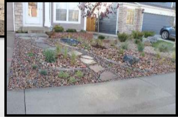
During construction and post-completion of a ColoradoScape in Town