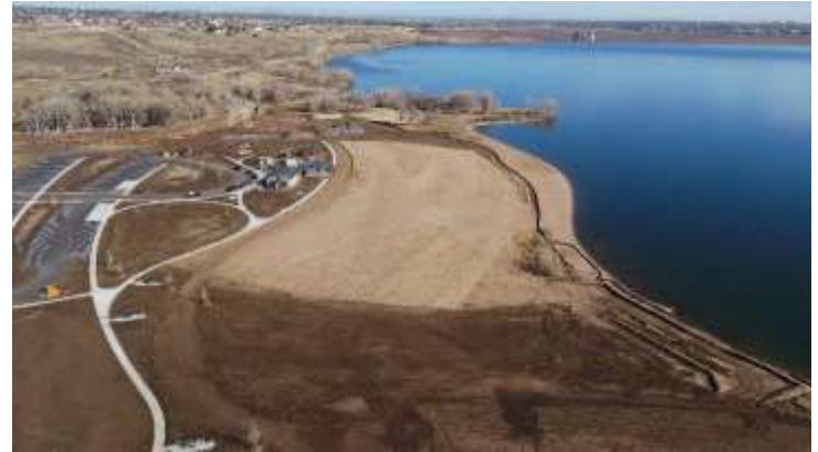
Reconstructed swim beach area