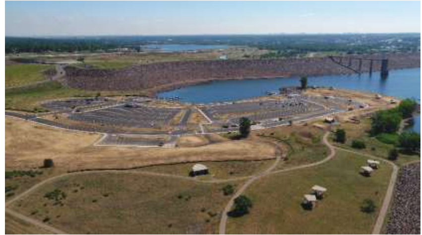
Reconstructed North Boat Ramp area