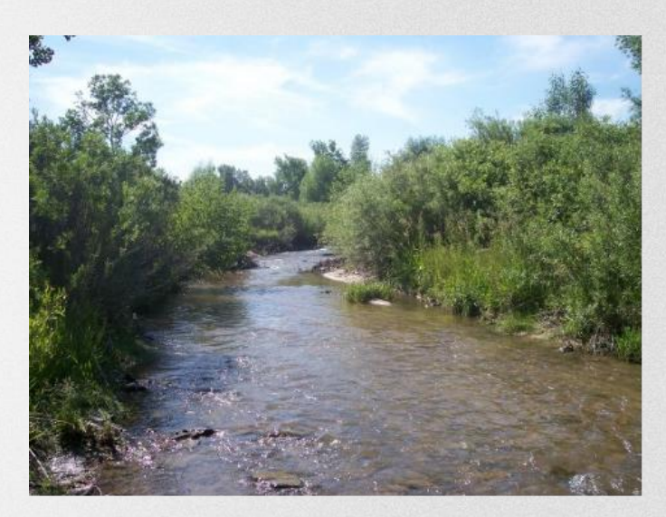
East Plum Creek near PCWPF