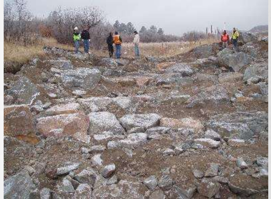
Boulder Cascade Structure on McMurdo Gulch in 2011