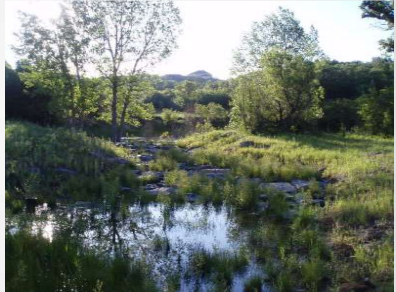
Completed drop structure on McMurdo Gulch