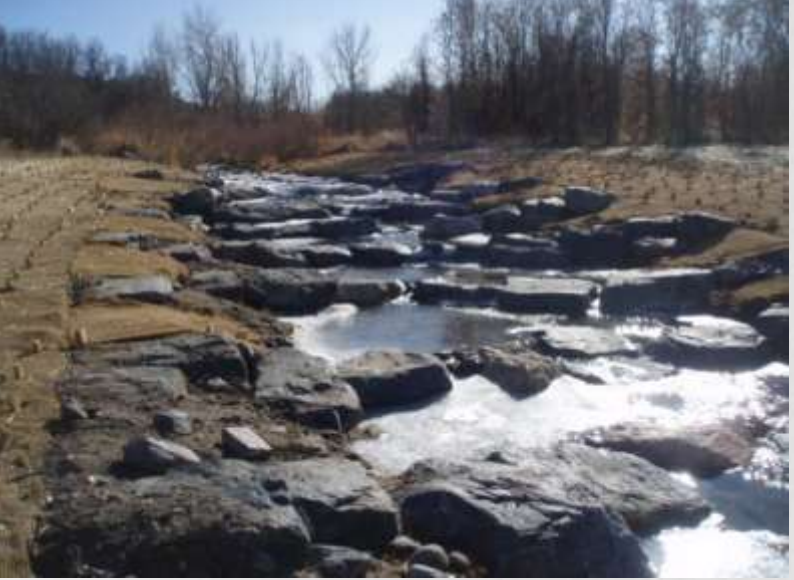
2020 COMPLETED PROJECT IMPROVEMENTS: MCMURDO GULCH PRIORITY 1 IMPROVEMENTS