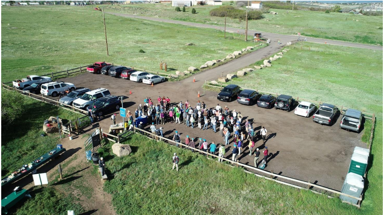
Figure 4: Trailhead and Parking Lot