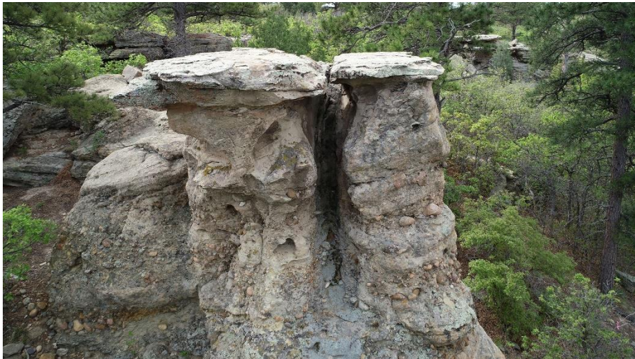
Figure 3: Unique Landforms

To the west, the views of the Front Range extend from Pikes Peak to the south to Longs Peak to the north.