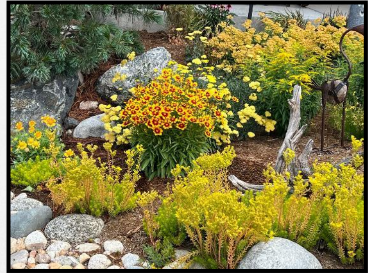
ColoradoScape Renovation (Terrain)