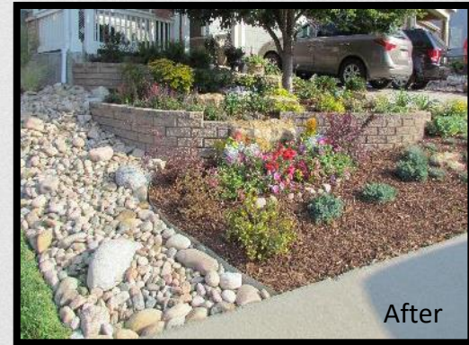
ColoradoScape Renovation (Meadows)