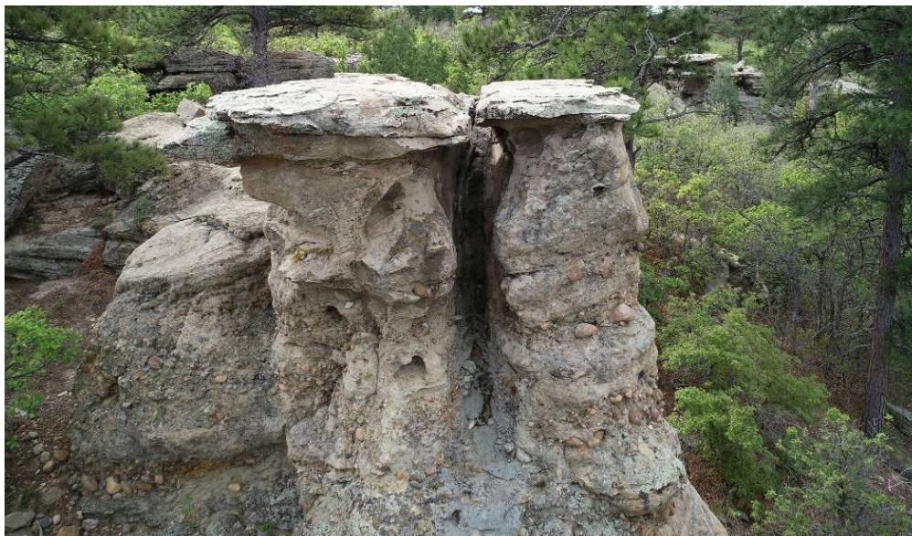
Figure 3: Unique Landforms

Due to the natural, scenic and open space condition of the property, a perpetual Conservation Easement (Easement) was established on the property in 1999. The Conservation Easement restricts the use of the property to public recreation, environmental education, and wildlife conservation. The Easement further prohibits timber