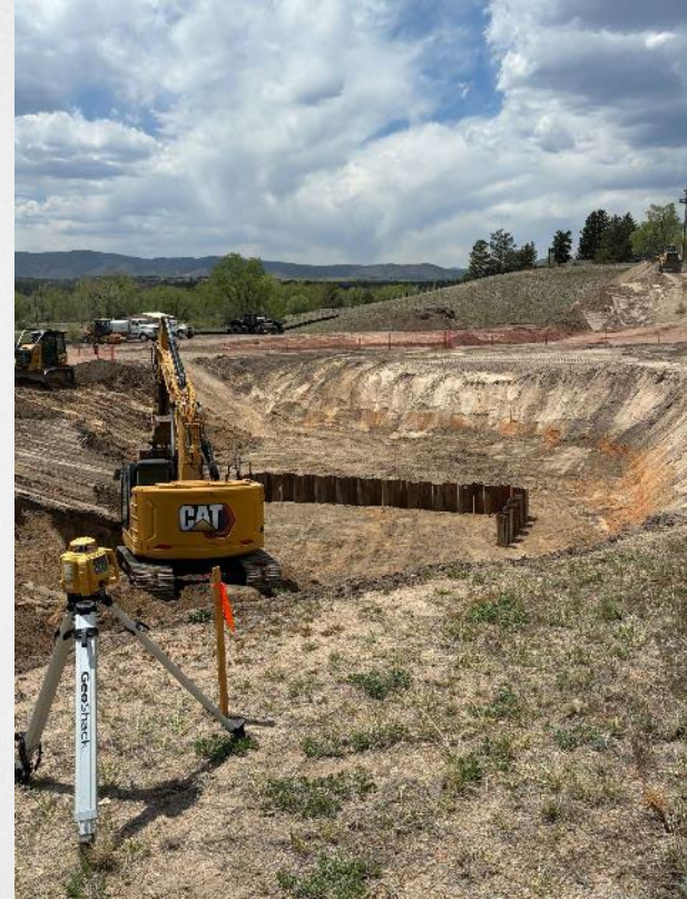
Lift Station Construction