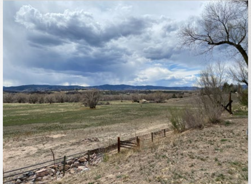
Lift Station Property