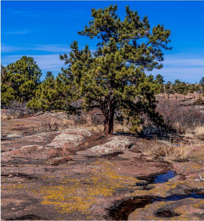
GATEWAY MESA OPEN SPACE