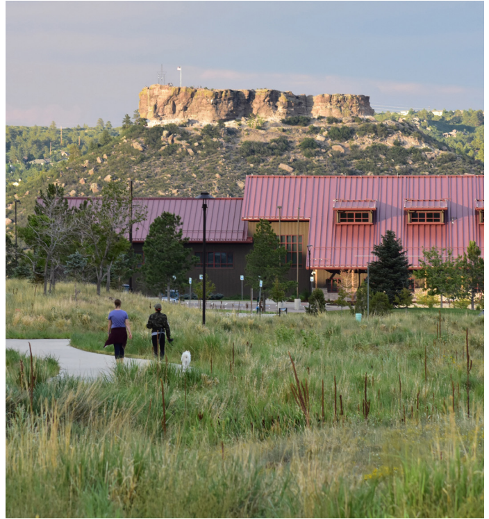
PHILIP S. MILLER PARK

197 vehicles on peak visitation day, Nov. 6