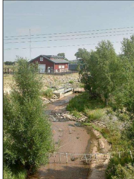
Plum Creek Diversion and Pump Station