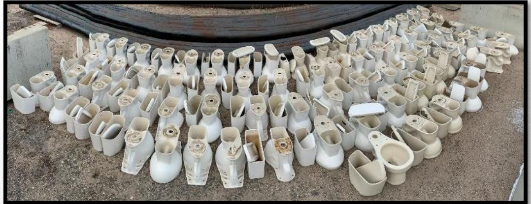
The “Throne Zone” – temporary storage of high water use ceramic toilets to be recycled