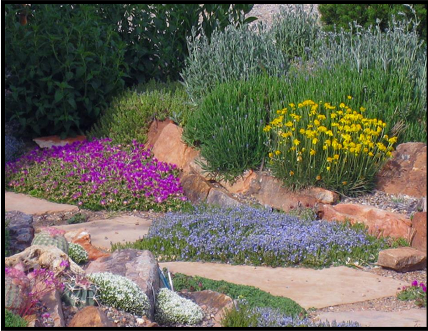
A ColoradoScape example