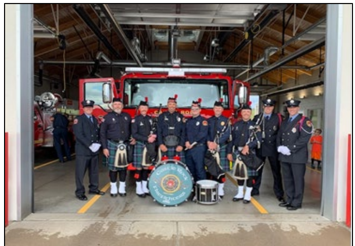
Our Honor Guard and Pipes and Drums