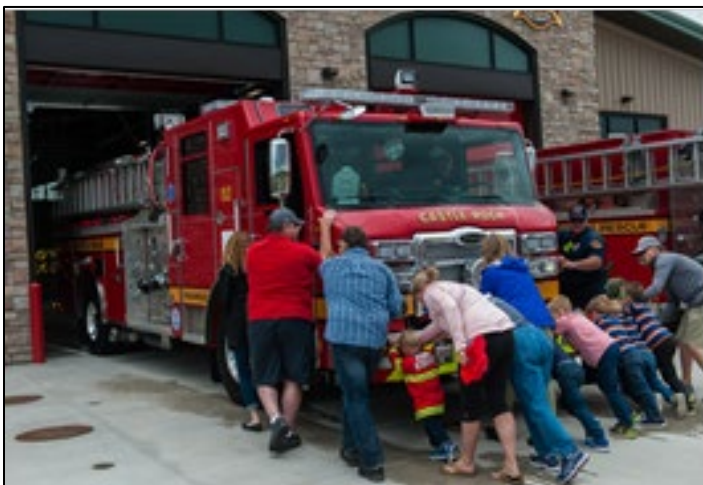
Using those muscles to push it in