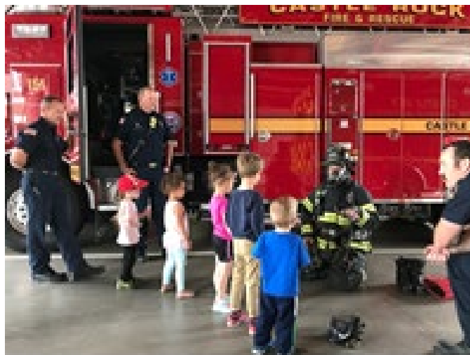
Teaching children what a firefighter looks like in full gear

The car seat technicians completed 35 car seat installations this month, with 28 of being rear-facing, indicating that these were mainly infant car seats. The majority of these were completed during the car seat event at Castle Rock Adventist.