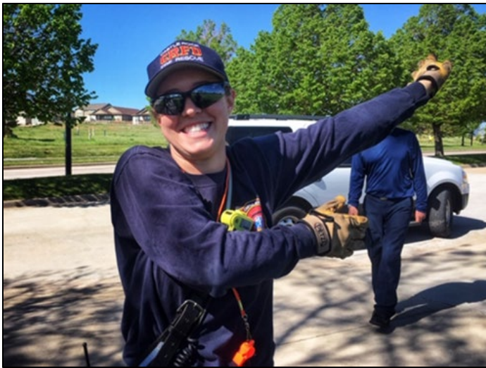
practicing hand signals for directing boat operations