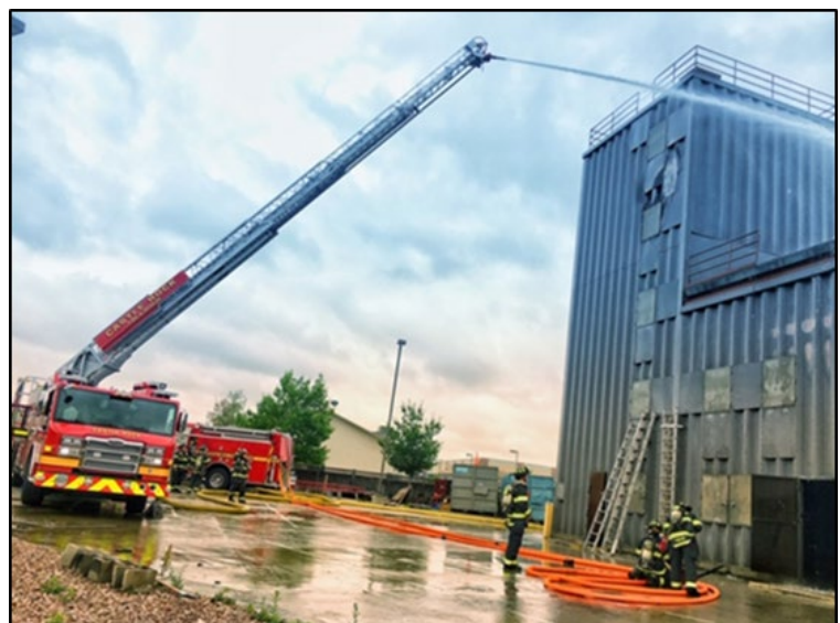
multi-company initial arrival drills