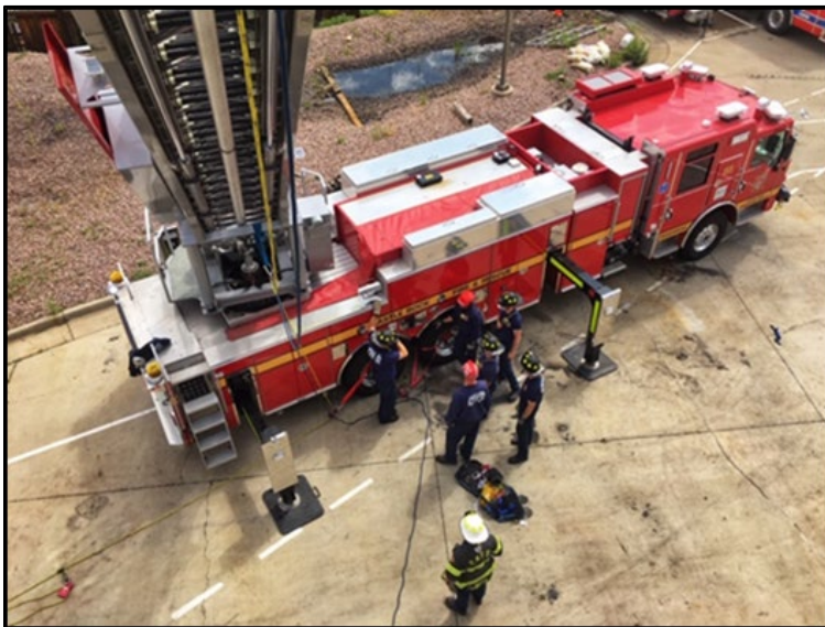
practicing rope rescue operations with the aerial device