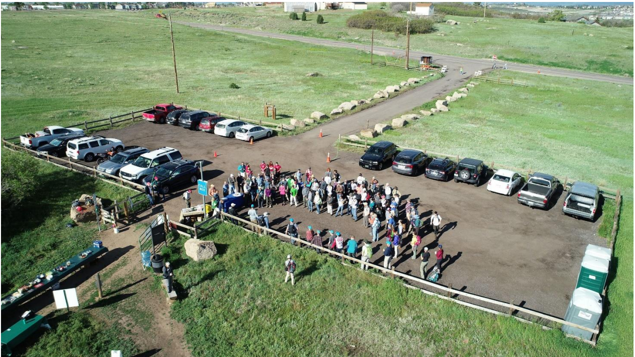
Figure 4: Trailhead and Parking Lot

Water, sanitary sewer and storm sewer facilities are not located on the property, nor necessary for the current uses on the property, or for the proposed PL-2 zoning.