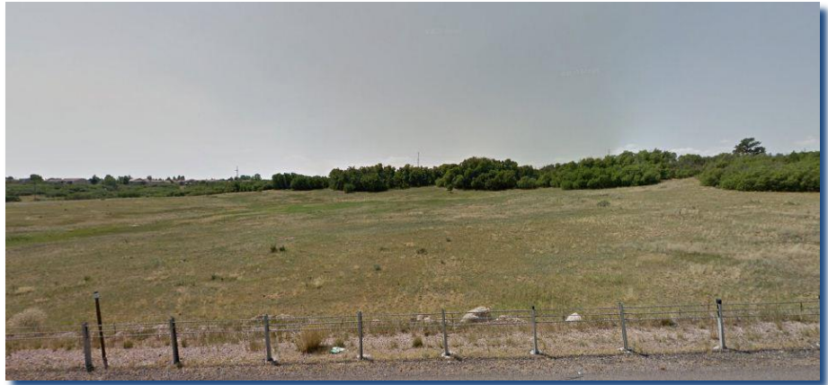
Existing View from State Highway 86 Looking North onto Property

This PDP includes 612 acres of the undeveloped land within the current Castle Oaks PD. The Terrain community is located generally east of the Founders Parkway/State Highway 86 intersection. McMurdo Gulch runs through the area from south to north. The area of this proposal is