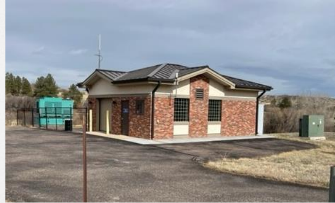
Castle Oaks Lift Station in Castle Rock, CO (typical lift station for Castle Rock)