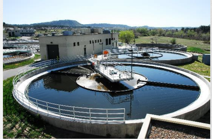
Plum Creek Water Reclamation Authority Castle Rock, CO