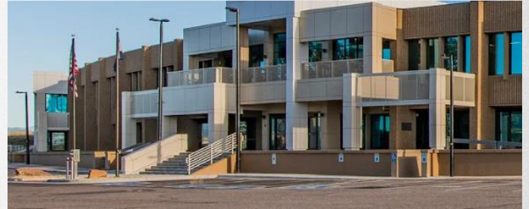
CORE Electric Coop Building in Sedalia, CO