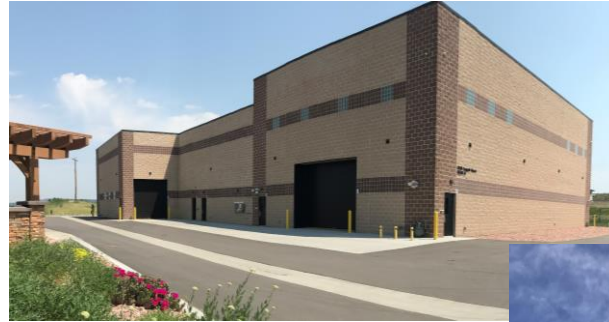
Advanced Treatment Building