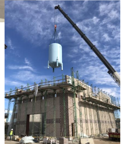
GAC Vessel Install