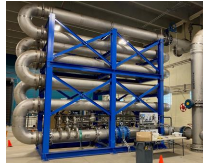
Ozone Loop Reactor