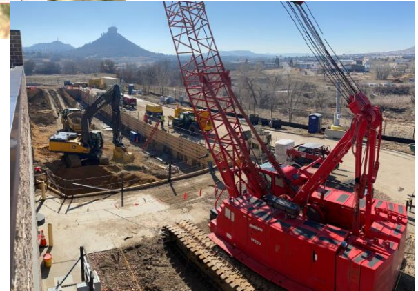
Excavation for new pretreatment