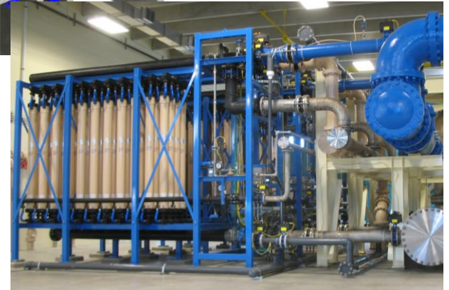
Membrane system at PCWPF