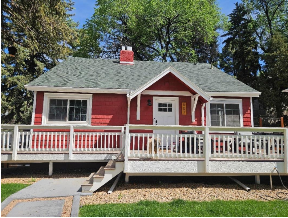
Figure 2: South Elevation (Front)

A Colorado Cultural Resource Survey was recently completed for the property at 607 Sixth Street. The attached survey is currently in draft form and is pending final review and approval by the Colorado State Historic Preservation Office (SHPO). According to the survey and Douglas County Assessor records, the residence was constructed in 1939. The building is a 1.5-story, square-plan, wood-frame residence resting on a concrete foundation. It is clad in replacement faux cedar shingle siding and features an asphalt composition side-gable roof with an interior brick chimney. Due to the sloping topography of the site, the basement level is exposed on the west elevation. The Cultural Resource Survey notes that the residence lacks a distinctive or readily identifiable architectural style and that the windows appear to be replacement vinyl units. The survey further documents a number of alterations over time, including the addition of a wraparound porch, replacement windows, boxed eaves, and re-siding of the structure. The residence is not designated as a local Historic Landmark.