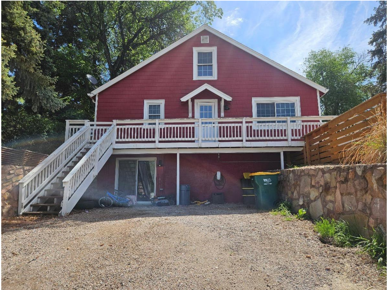
Figure 3: West Elevation (Side along Cantril Street)

The Cultural Resource Survey documents several alterations to the residence. The wraparound porch appears to have been added circa 1984. Between approximately 2002 and 2012, the exposed rafter ends were replaced with boxed eaves and the primary elevation windows were replaced, altering both the material and design of the original windows. Between 2012 and 2015, the residence was re-sided with faux cedar shingles. Due to these alterations, the historic design, materials, and workmanship of the building are no longer clearly evident.