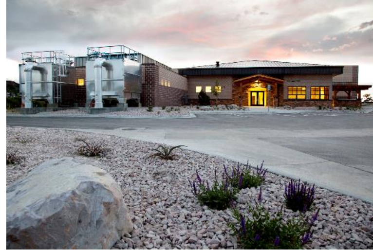
Plum Creek Water Purification Facility