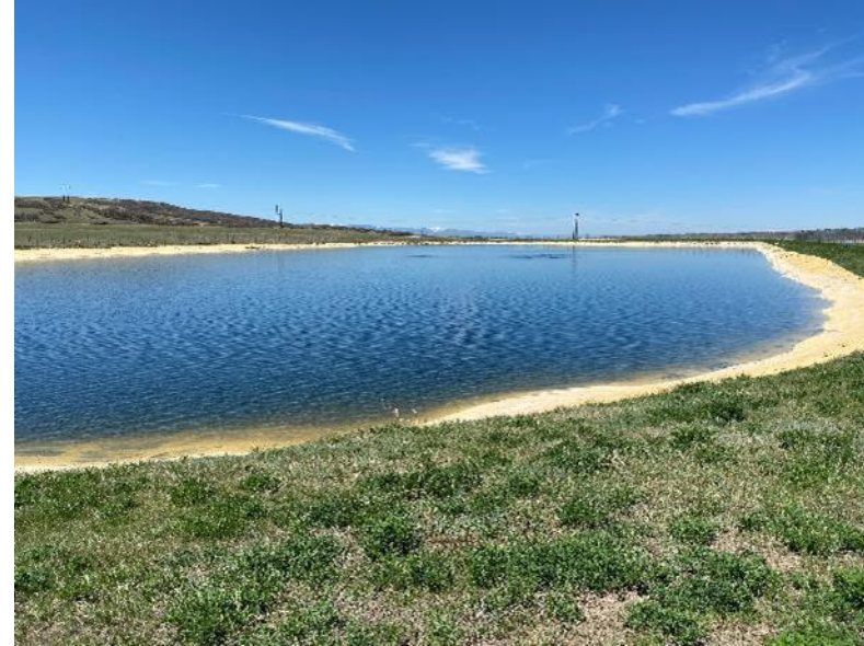
Castle Rock Reservoir 1