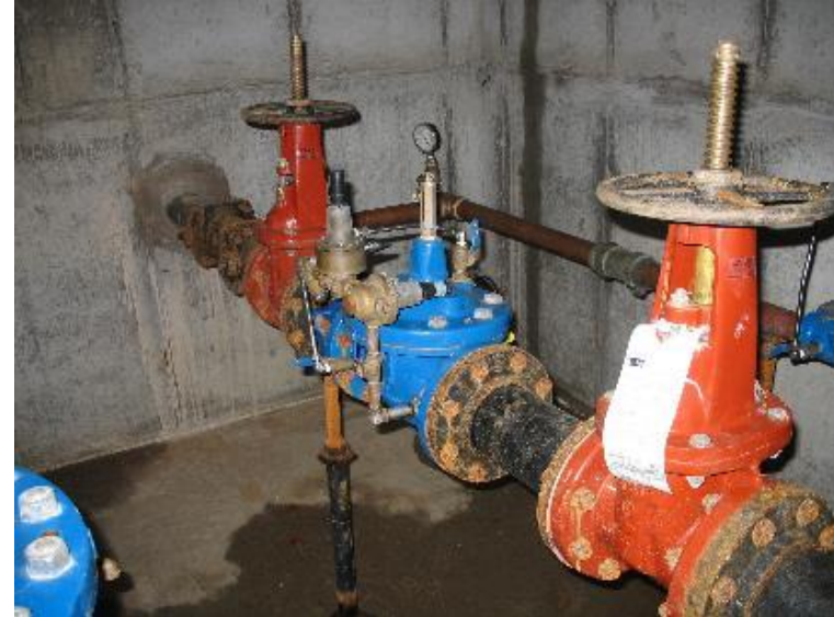
Pressure Reducing Valve Vault