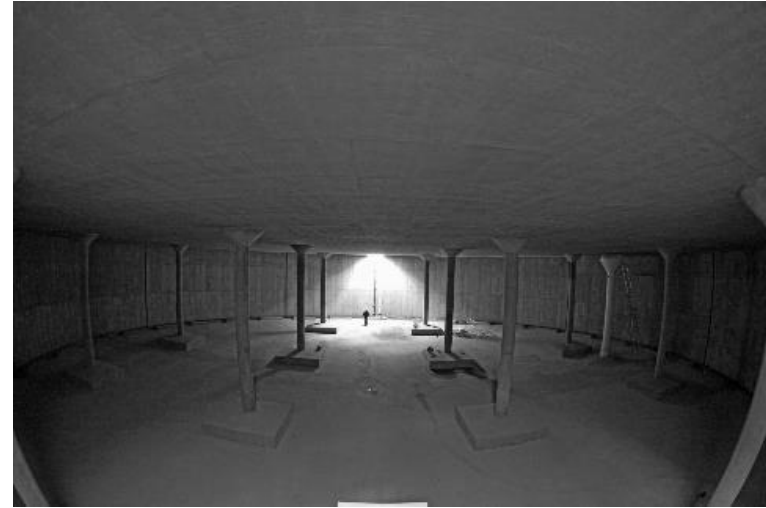
Inside a Water Tank