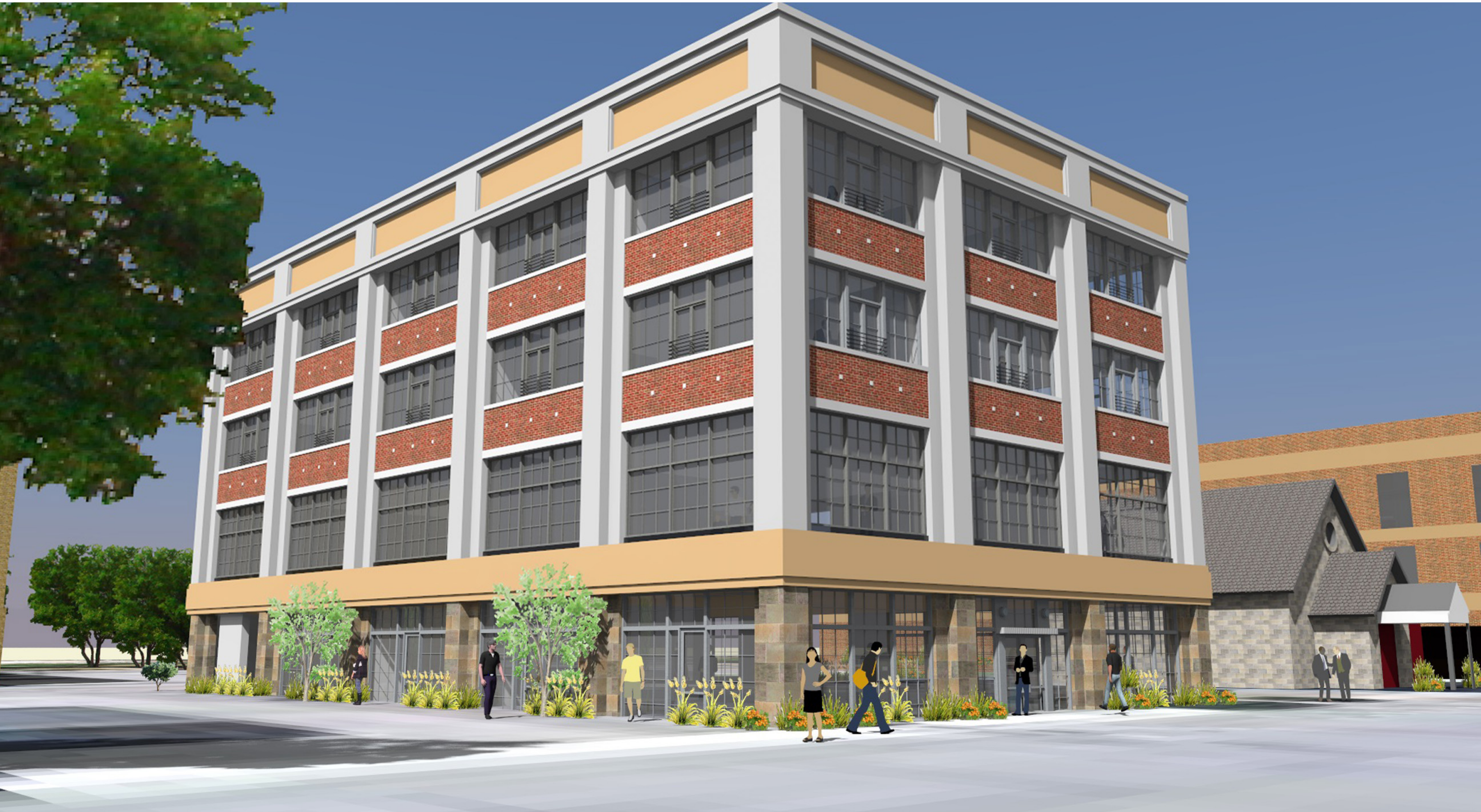
MERCANTILE COMMONS 230 3rd Street