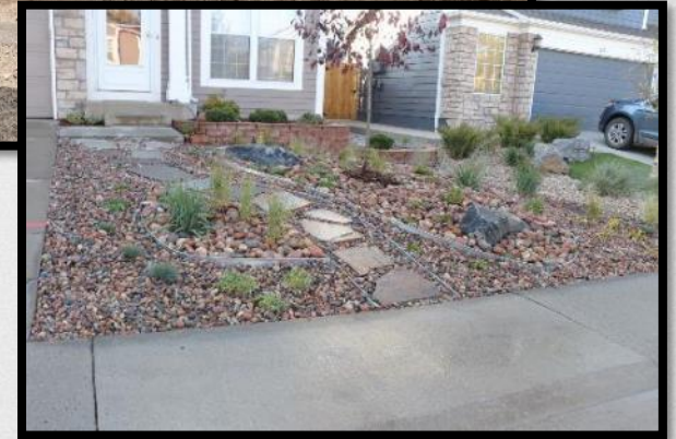
During construction and post-completion of a ColoradoScape in Town