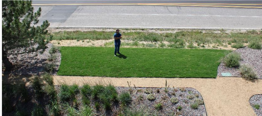
500 square feet of experimental Tahoma Bermuda Grass (super low water using turf) at Castle Rock Water Administration Building