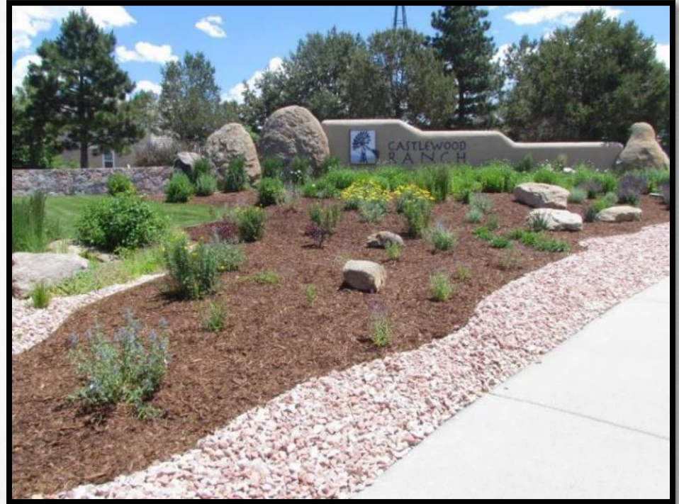
Castlewood Ranch (at Mikelson Street) after a ColoradoScape project