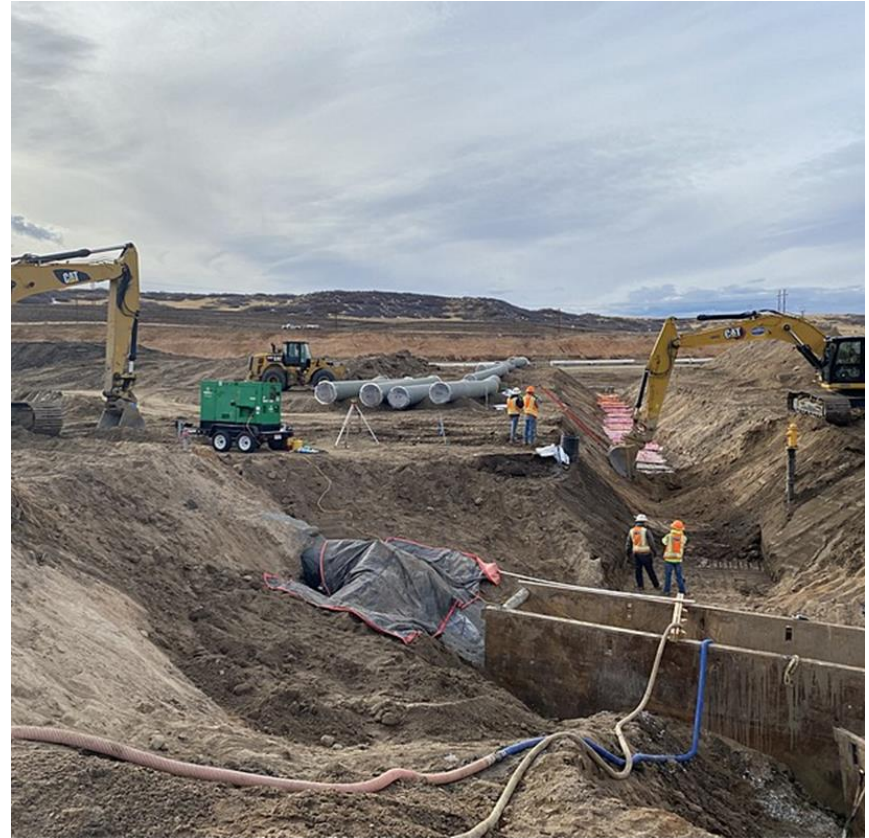
PIPE INSTALLATION WORK FOR CRR2