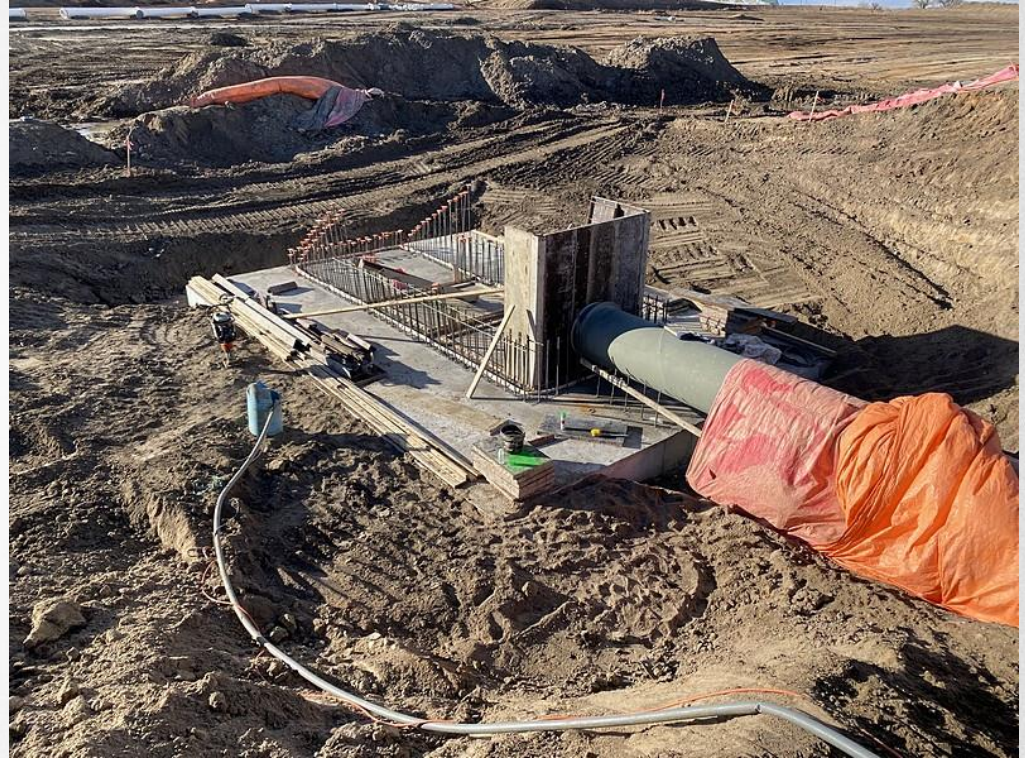
STEEL PIPING STRUNG OUT WITHIN THE CRR2 ENVELOPE