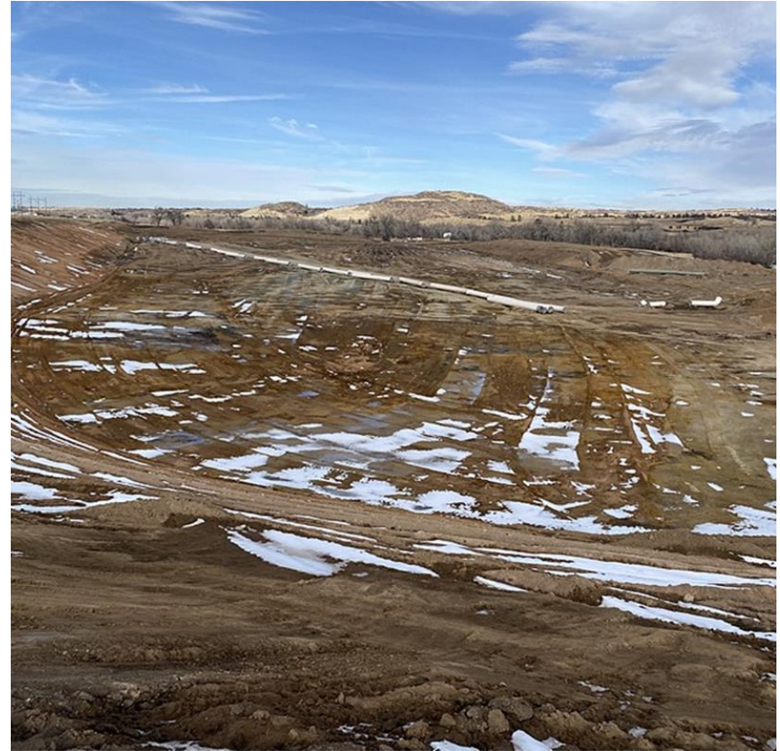
GRADING WORK FOR CRR2