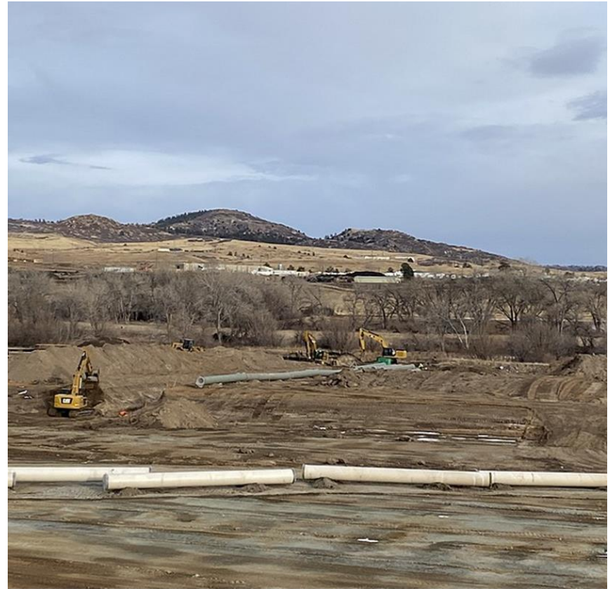
STEEL PIPING STRUNG OUT WITHIN THE CRR2 ENVELOPE