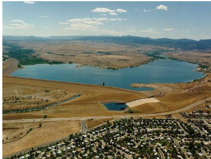
Aerial View of Chatfield Reservoir