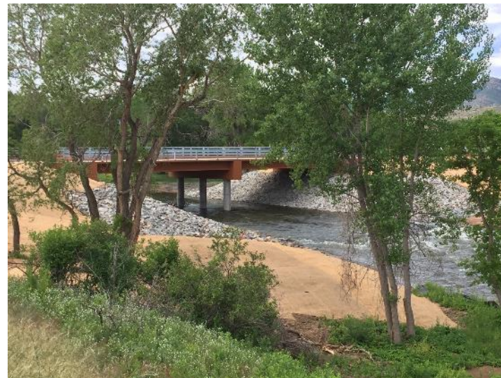
SOUTH PLATTE RIVER JUST PRIOR TO CHATFIELD RESERVOIR