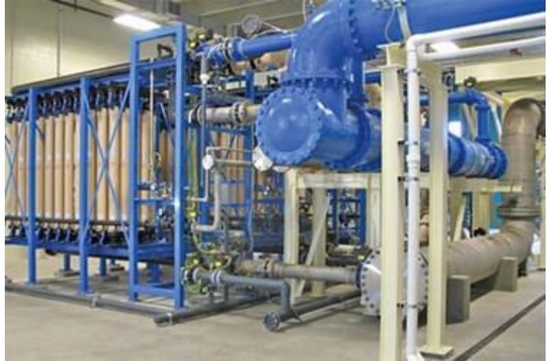
Plum Creek Water Purification Facility