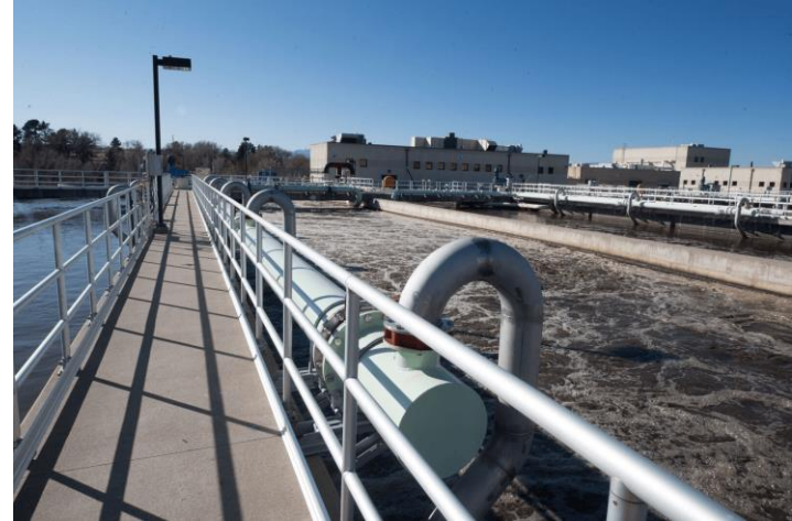
Plum Creek Water Reclamation Facility