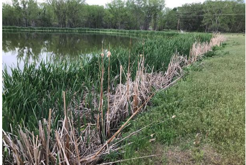
Louviers Wastewater Treatment Lagoon