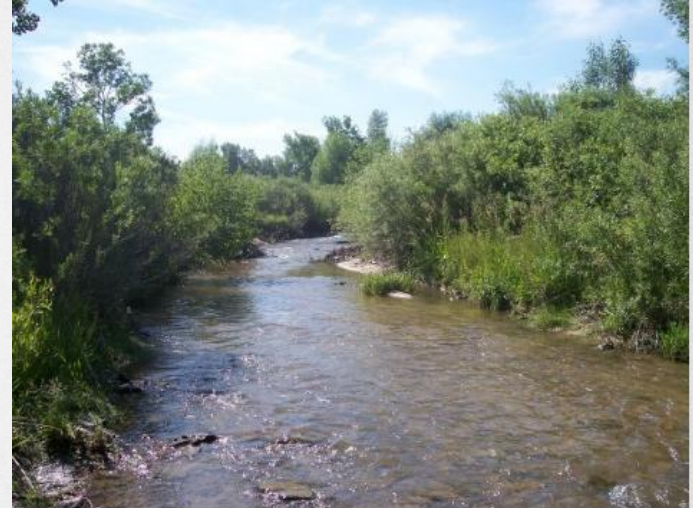
East Plum Creek near PCWPF